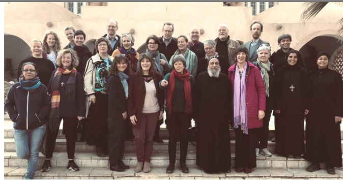
Anafora Retreat Centre, north of Cairo